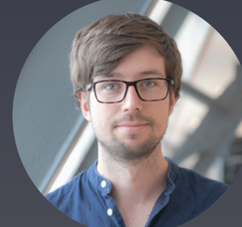
Boris Duval Communications