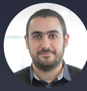
Jad El Cham Community Development